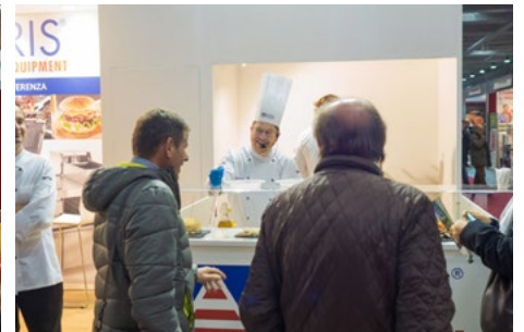
Foodservice and Professional Equipment Show